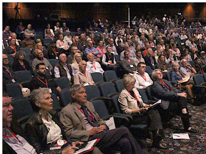
Events – education and support