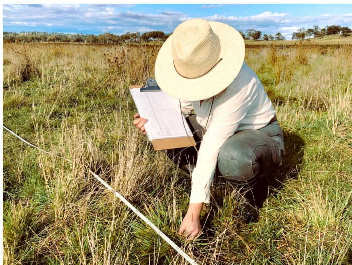
Annual ecological monitoring